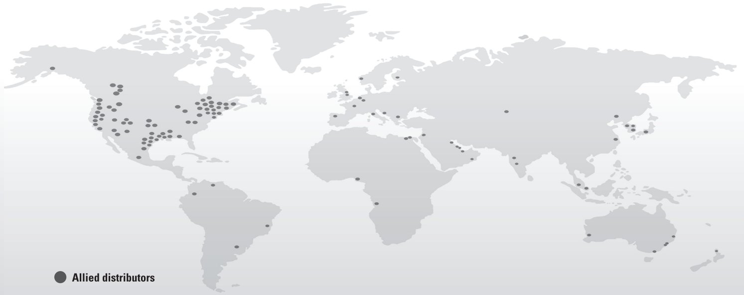
● Allied distributors